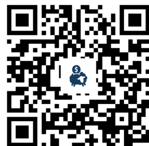
Give to Saint Charles

Thus, without a human nature, there is no truly human center of emotion, no human intellect, and no human will. And without these not only is there no real death or fear of death, but there is no choice to sacrifice self for the other, nor any real price being paid. God could, of course, nonetheless save us, but not with the great compassion of taking on a heart that could be pierced and a heart that could suffer the loss of family, friends, and followers, come face to face with death and yet choose to go on, despite it all and at great cost. If there is no truly human heart, that symbolic seat of human pathos, then there is no real compassion on the part of God, because nothing has been ventured and, so, nothing is gained. But we know that when they came to Jesus and saw that he was already dead, they did not break his legs, but one soldier thrust his lance into his side, and immediately blood and water flowed out. An eyewitness has testified, and his testimony is true; he knows that he is speaking the truth, so that you also may [come to] believe (Jn 19: 33-35).