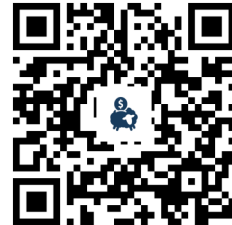
Give to Saint Charles

For Saint Charles Borromeo— Use the QR code at the right to give one time, or to set up recurring donations. On the flocknote Giving Page you can choose your donation type.