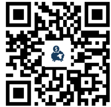
Give to Saint Catherine

For Saint Catherine of Siena — Use the QR code at the left to give one time, or to set up recurring donations. On the flocknote Giving Page you may choose your donation type.