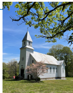
Mary Immaculate Church

Sunday June 11, 2023—Business meeting at 6 p.m. Sunday June 18, 2023—Business meeting and dinner with Auxiliary at 6 p.m.