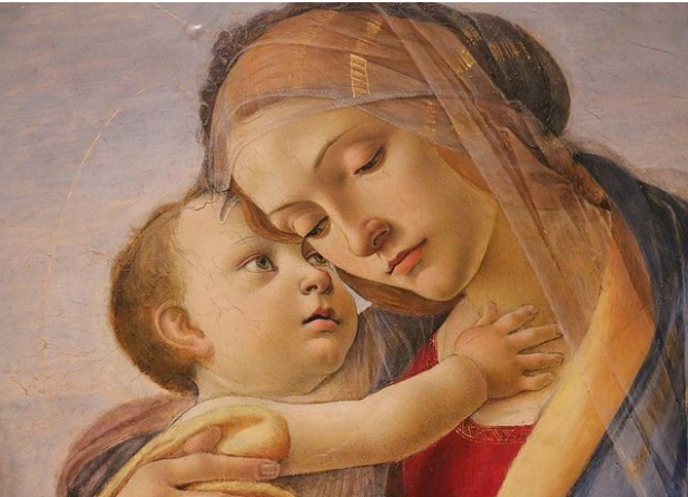
Madonna and Child—Botticelli

Christmas is a feast of Christ and, at the same time, a Marian feast. It is the coming of the Christ into the world, and it is a time that we honor Mary, as she said to her cousin Elizabeth, “Behold, henceforth all generations will call me blessed” (Luke 1:48).