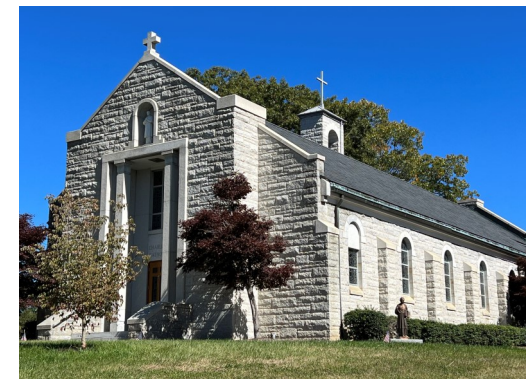
ST. CHARLES BORROMEO

Sunday Rosary: 10:30 a.m. Sunday Mass: 11:00 a.m. Sunday Confession 12:15 p.m.