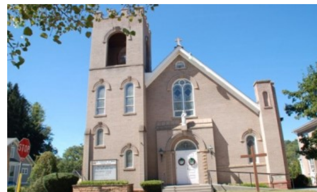
ST. CATHERINE OF SIENA