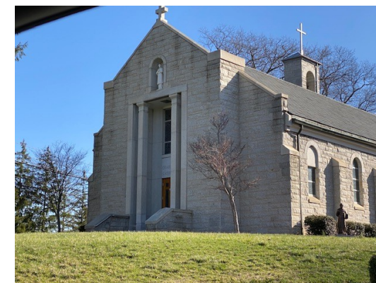
ST. CHARLES BORROMEO Established 1903

Sunday Rosary: 10:30 a.m. Sunday Mass: 11:00 a.m. Sunday Confession 12:15 p.m.