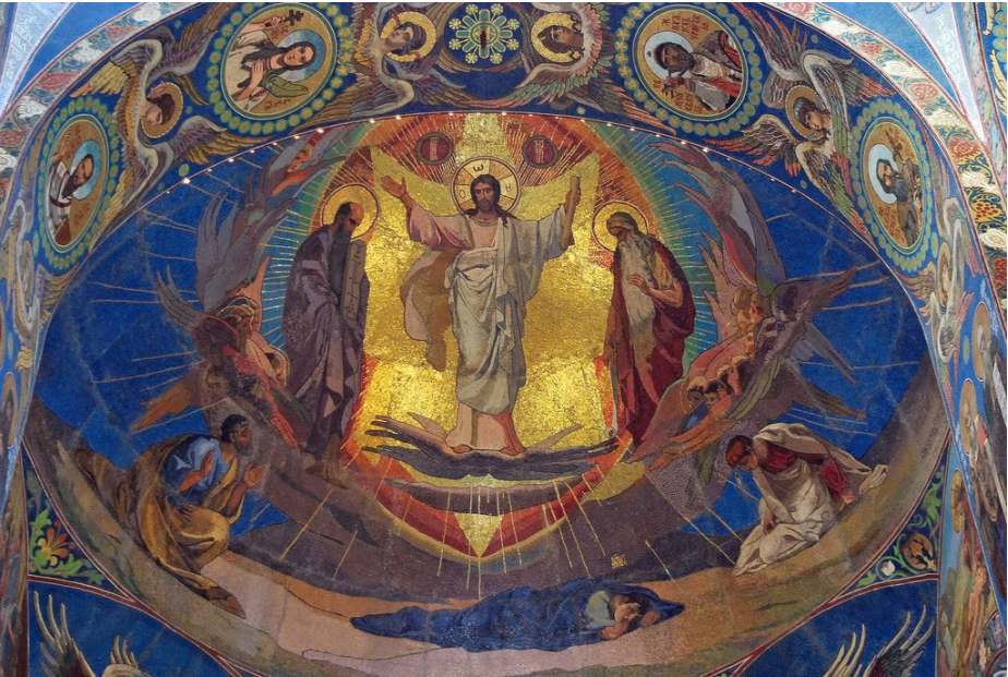
The Transfiguration of Jesus Mark 9: 2-10

To report an incidence of suspected child sexual abuse, please contact your local law enforcement agency, or you may confidentially contact WV child Protective Services at 800.352.6513. To report suspected cases of sexual abuse by personnel of the Diocese of Wheeling-Charleston, please contact the diocese at 888.434.6237 or 304.233.0880.