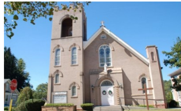
ST. CATHERINE OF SIENA Established 1892