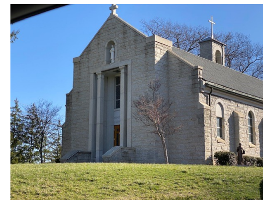
ST. CHARLES BORROMEO Established 1903

Sunday Rosary: 10:30 a.m. Sunday Mass: 11:00 a.m. Sunday Confession 12:15 p.m.