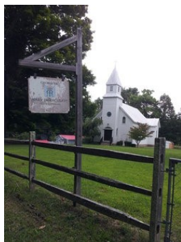
Mary Immaculate Church built 1902

Sunday May 7, 2023 at 6 p.m. at St. Charles Parish Hall Dinner honoring everyone who helped with Fish Dinners. Main entrée will be provided. Bring a dish to share